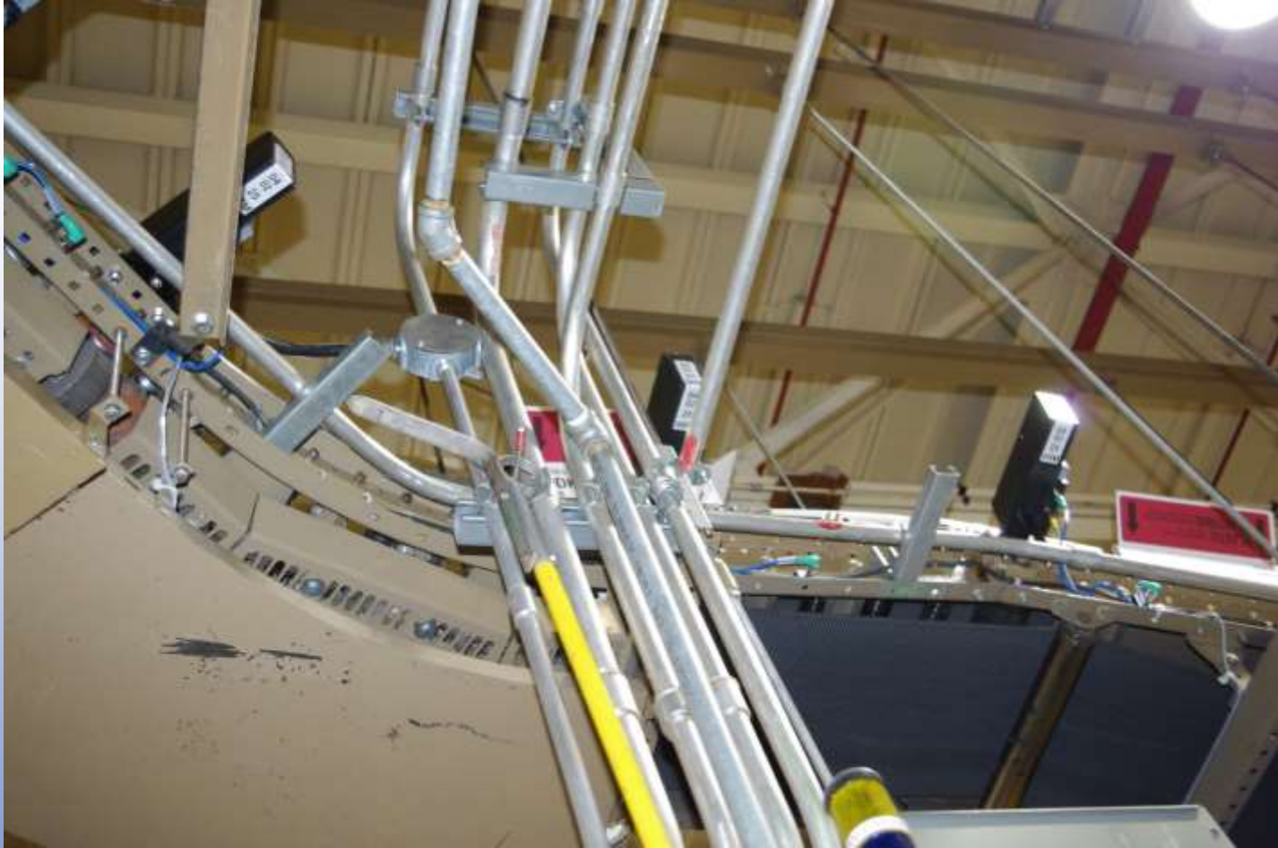
Overhead Box Conveyor