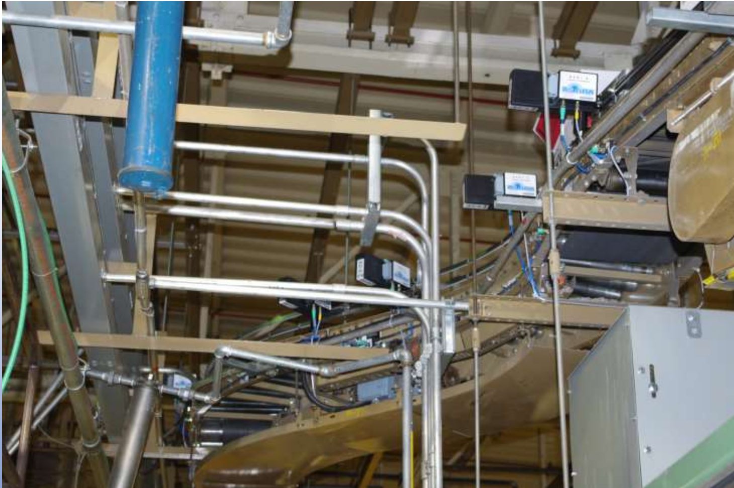
Overhead Box Conveyor with ASTRRA flex Rails