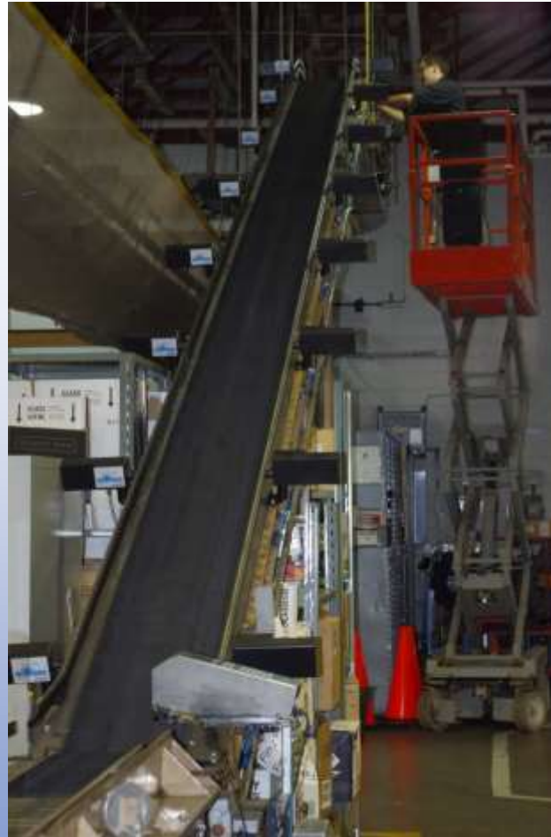
Overhead Box Conveyor