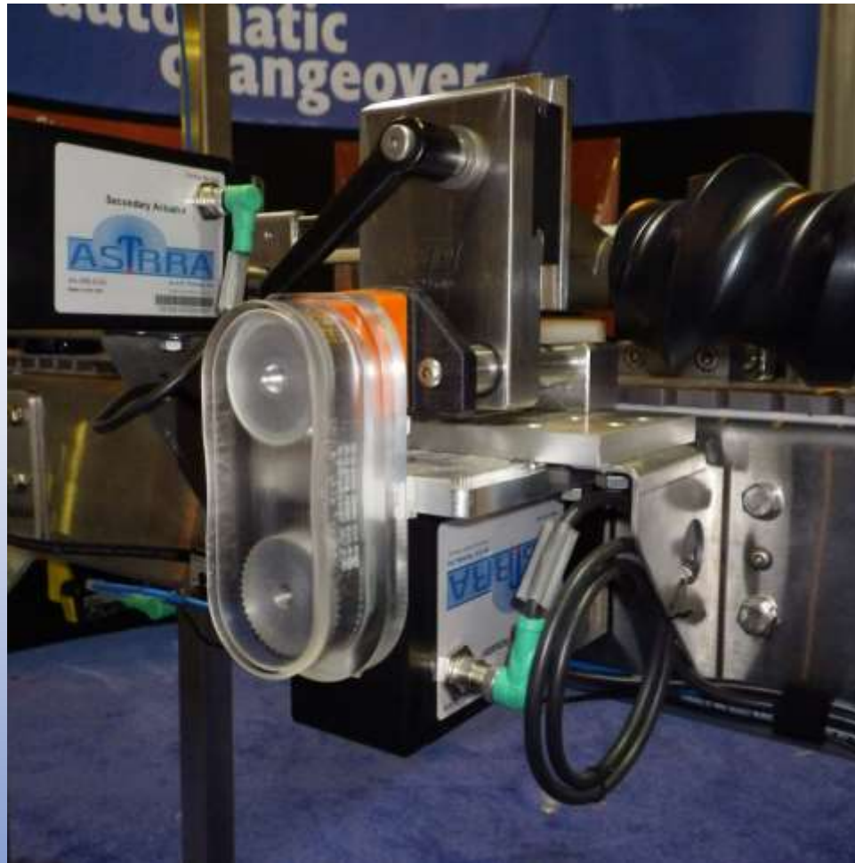
Timing screw adjustment with rotary