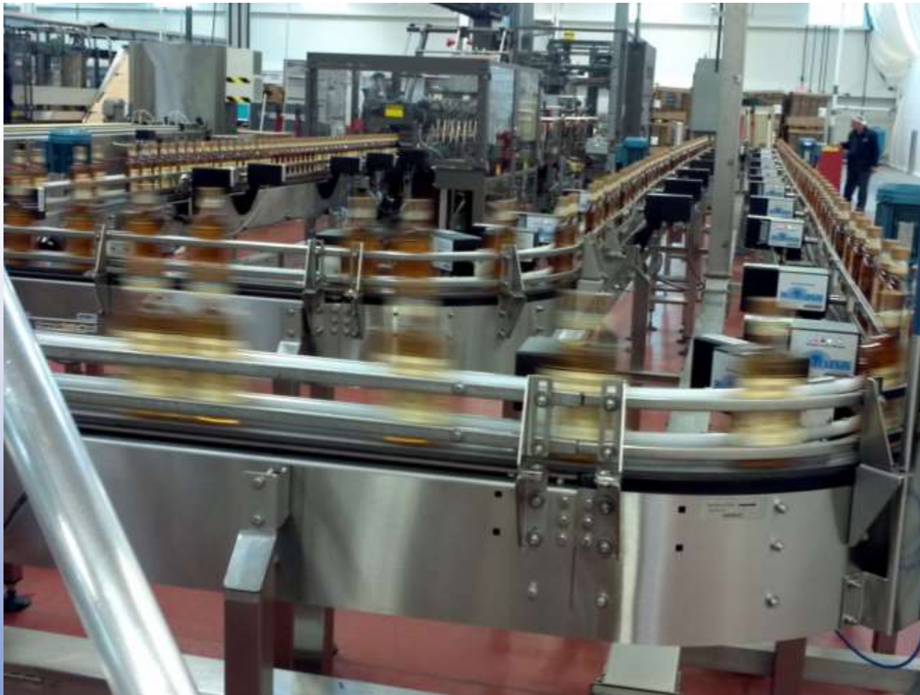
Single Sided Guide rail adjustment