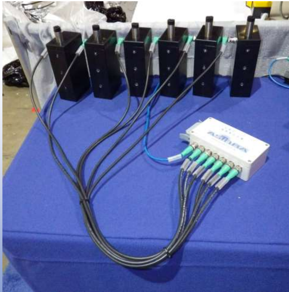
SixPack with six individual 100mm 2G actuators