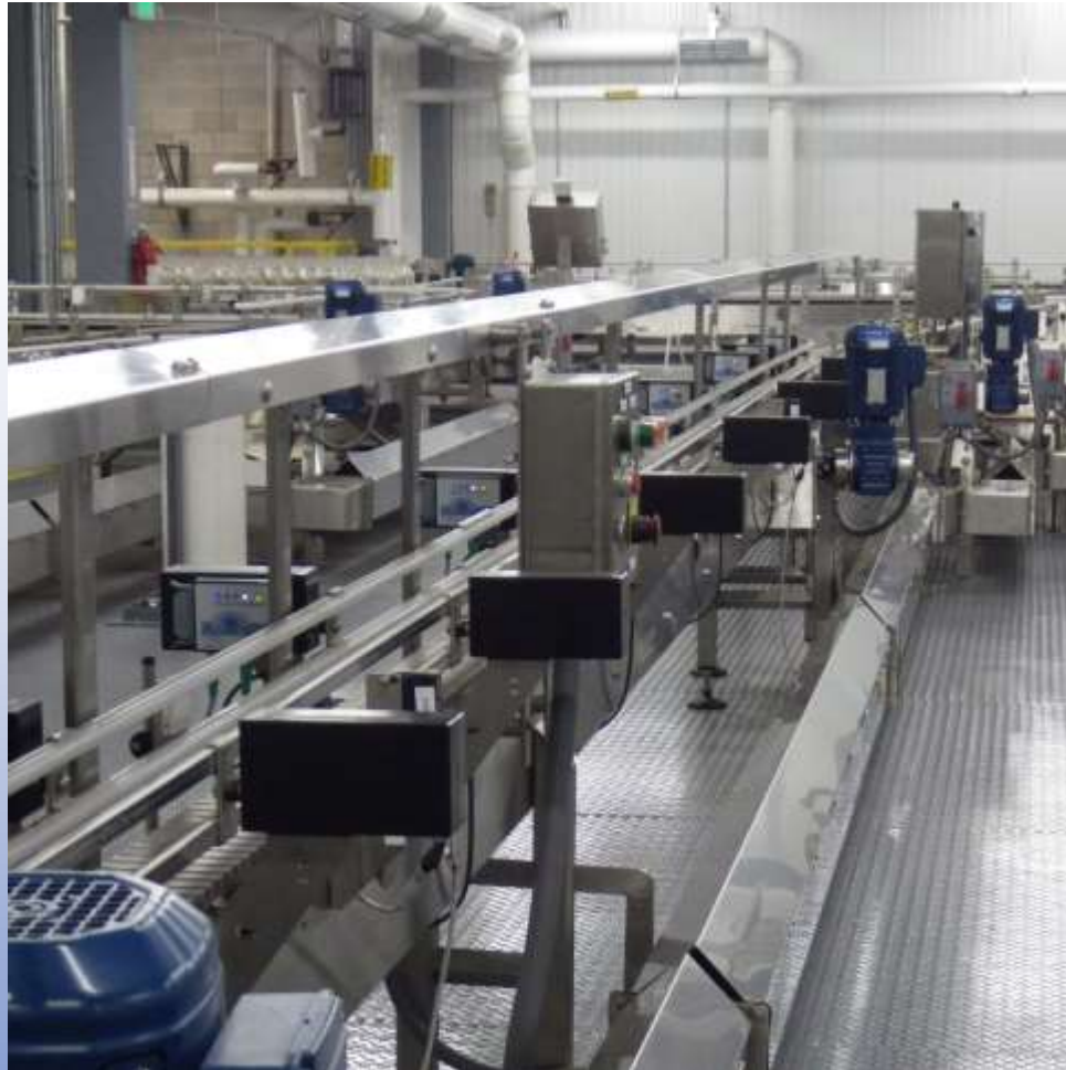
Double sided adjustment